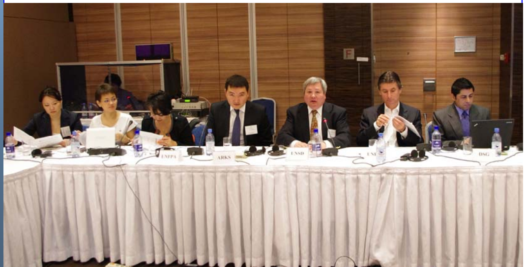
Workshop on CensusInfo for the Commonwealth of Independent States (CIS) Almaty, 15-18 May 2012