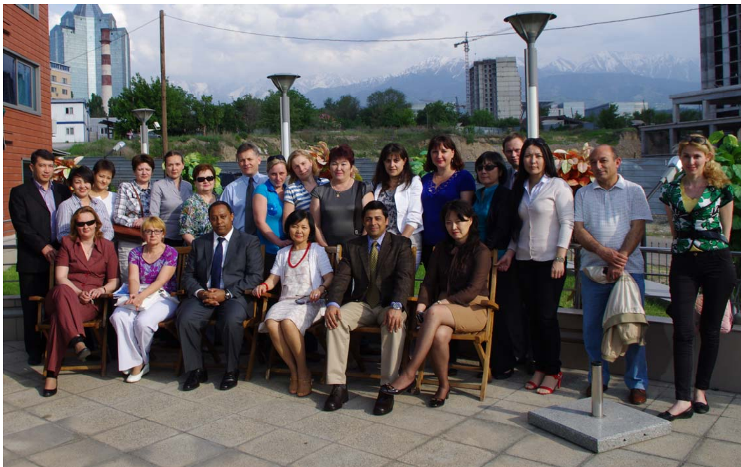
Workshop on CensusInfo for the Commonwealth of Independent States (CIS) Almaty, 15-18 May 2012

CensusInfo is a software package developed by the United Nations Statistics Division in partnership with UNICEF and UNFPA to help countries disseminate their census data on CD-ROM and on the web. It was officially launched at the United Nations Statistical Commission on 23 February 2009 and is distributed royalty-free. More information on CensusInfo is available at the website dedicated to its promotion: http://www.censusinfo.net