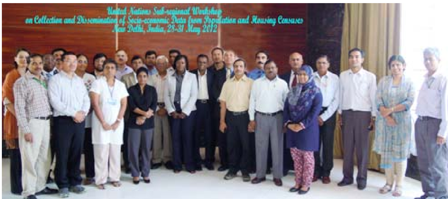
Workshop on Collection and Dissemination of Socio-Economic Data from Censuses New Delhi, 28-31 May 2012

The session on recommended topics and tabulations of the United Nations Principles and Recommendations for Population and Housing Censuses, Revision 2, stressed the importance of the extensive regional and international consultations as a major corner stone in the development of both the core topics and the recommended tabulations. The presentations in this session defined the core topics as the main variables for the recommended tabulations. These are those census topics on which there is substantial agreement among regions of the world in regard to both their importance and the feasibility of collecting data on them in a census. The presentation summarized the core topics of Revision 2 of the Principles and Recommendations and highlighted the differences between this set and the