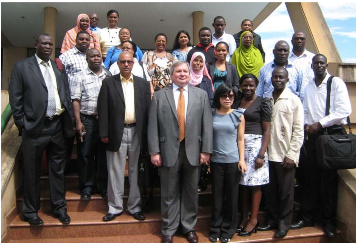
Workshop on Evaluation of Census Data Kampala, 12-16 November 2012

More information on the workshop, including all of the presentations delivered, is available on the UNSD website: http://unstats.un.org/unsd/demographic/sources/cwp2010/docs.htm