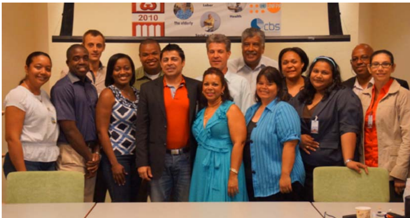
Workshop on CensusInfo for Dutch-speaking Caribbean Countries Oranjestad, Aruba, 26-30 November 2012

CensusInfo is a software package developed by the United Nations Statistics Division in partnership with UNICEF and UNFPA to help countries disseminate their census data on CD-ROM and on the web. It was officially launched at the United Nations Statistical Commission on 23 February 2009 and is distributed royalty-free. More information on CensusInfo is available at the website dedicated to its promotion: http://www.censusinfo.net