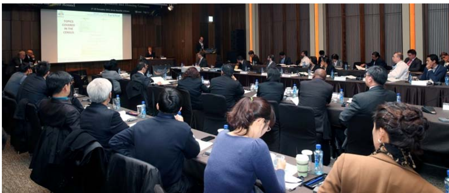
International Seminar on Population and Housing Censuses Seoul, 27-29 November 2012