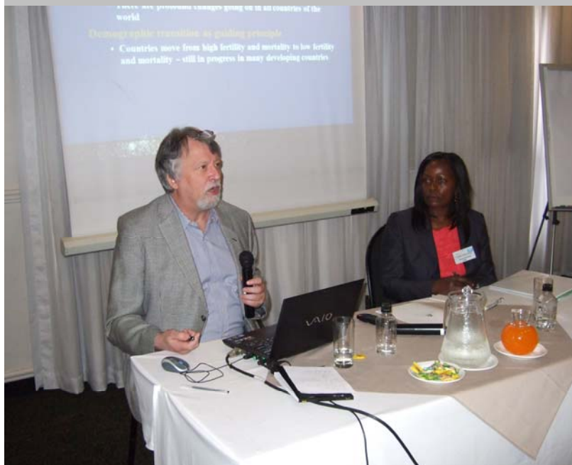
Workshop on Population Projections for English-speaking African Countries, Pretoria, 29 October–2 November 2012

The United Nations Statistics Division (UNSD) organized two workshops on population projections for English- and French-speaking African countries. The purpose of the workshops was to provide training to participating countries on how to generate population projections using census data. The participants also learned about available software packages for generating population projections. The workshops also drew participants' attention to the necessary preparatory work before undertaking the population projections.