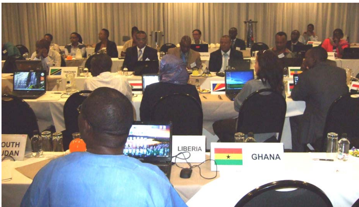
Workshop on Population Projections for English-speaking African Countries Pretoria, 29 October–2 November 2012

More information on the workshops including presentations and materials used are available on the UNSD website: http://unstats.un.org/unsd/demographic/sources/cwp2010/docs.htm