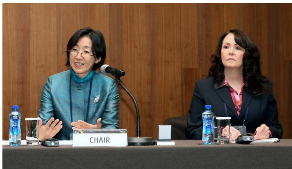
International Seminar on Population and Housing Censuses Seoul, 27-29 November 2012

(i) Technology for census data dissemination has improved over time. While the use of such technology has enhanced data utilization, participants pointed out that there is a challenge for harnessing of these technologies at grass root level. Participants also stressed that countries should put in place a strategy for marketing of census information as part of the data utilization plan. Furthermore, in view of growing demands for census micro data, it is important to ensure the confidentiality of data through anonymization process or statistical measures, in order to maintain the trust of the general public.