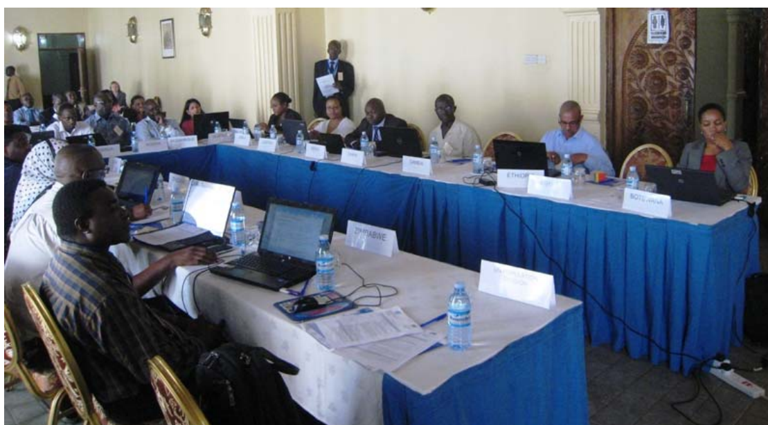
Workshop on Evaluation of Census Data Kampala, 12-16 November 2012

In a follow-up remark, H.E. Mr. Aston Kajara, the Minister of State for Finance of Uganda, welcomed the participants and workshop organizers. Mr. Kajara noted that quality data is the cornerstone of good government planning, and that census data is the foundation for many statistical indicators that are critical for Africa at this stage in the continent’s development. He added that there is a great need for continuous measurement of the outputs of programmes and initiatives in order to provide data-based evidence for decision-making and to promote sustainable development. Mr. Kajara concluded by stressing the importance of disseminating up-to-date census results in order to help justify the cost of the census.