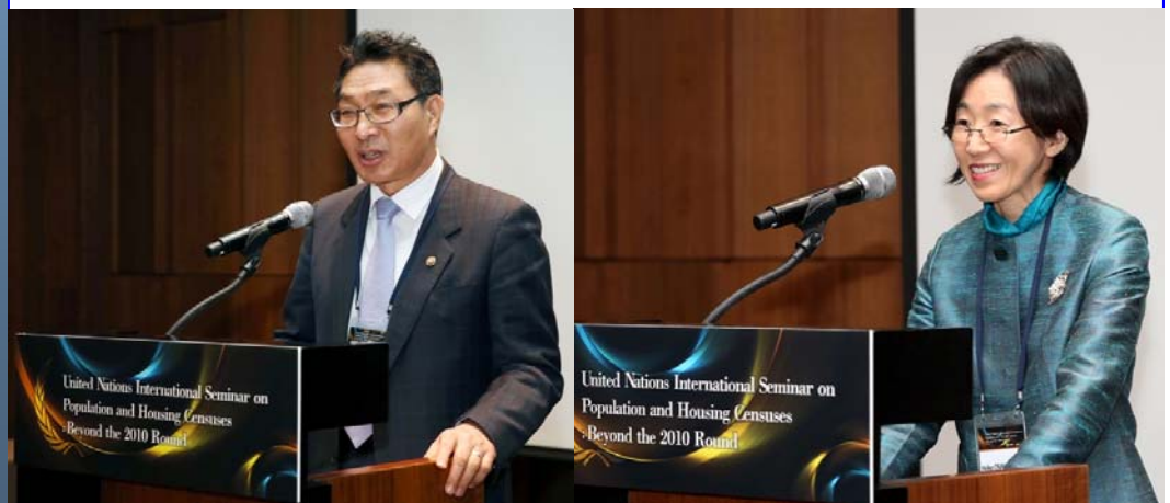
International Seminar on Population and Housing Censuses Seoul, 27-29 November 2012