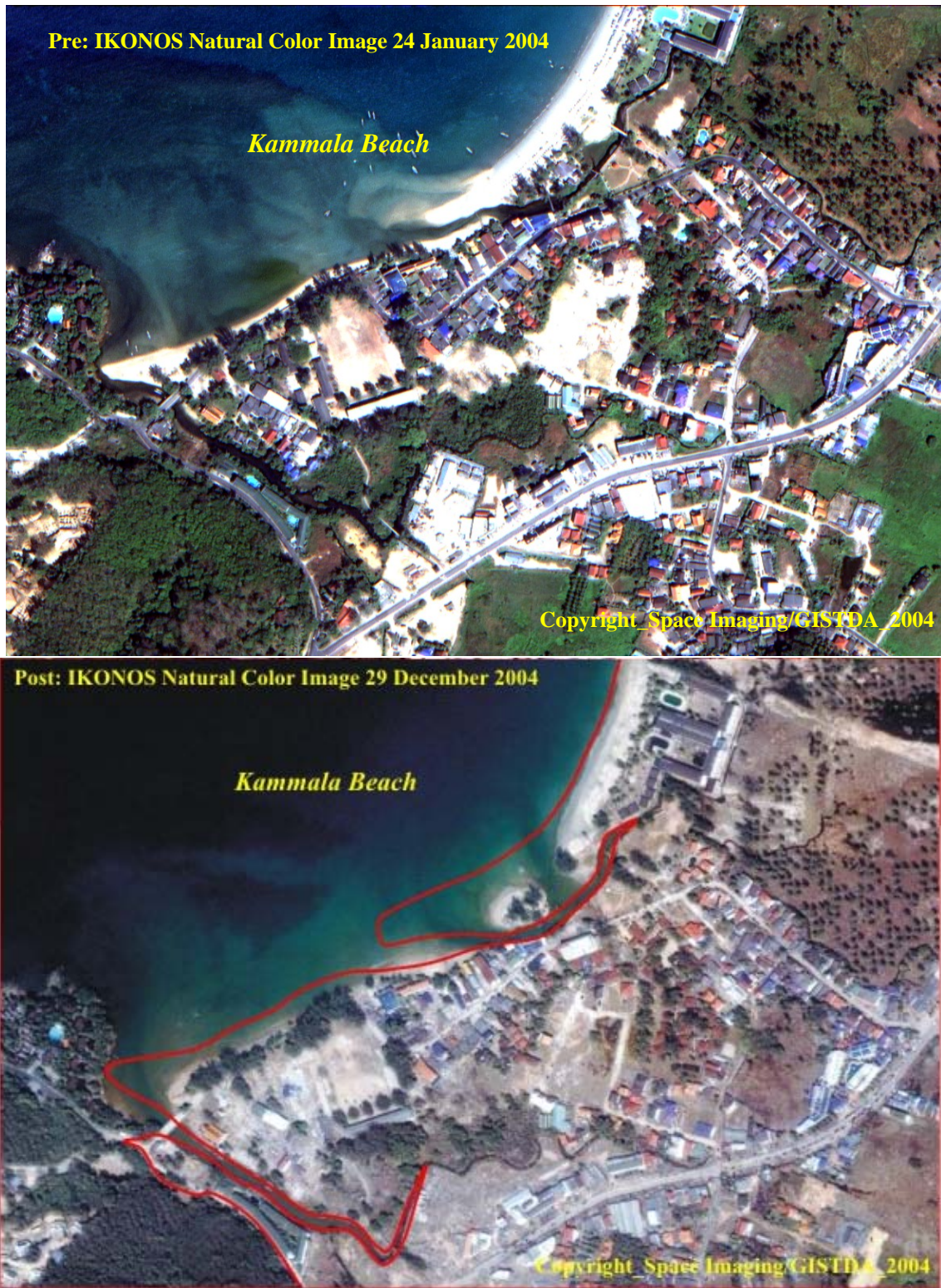
Figure 3 Pre and post natural color composite IKONOS images of Kammala beach, Phuket province taken on January 24, 2004 and December 29, 2004 showing before and after shoreline and river bank erosion in red and yellow respectively.