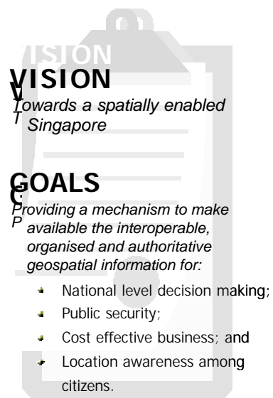
Figure 1: SG-SPACE vision and goals

SG-SPACE is the Singapore Geospatial Collaborative Environment, a national initiative which aims to provide a platform and mechanism for government agencies to create a sustainable environment to share and use geospatial data which is interoperable, accessible and usable. This collaborative effort is jointly driven by the Singapore Land Authority (SLA) and the Infocomm Development Authority (IDA) of Singapore. Together, the two Statutory Boards are jointly leading the whole-of-government efforts to develop and implement a three-year masterplan to foster a thriving geospatial industry in Singapore. The benefits of this initiative will be extended to its enterprises and citizens for value and knowledge creation. It will reduce duplication of efforts in geospatial information collection, management and updating within the Singapore public sector and offer potential for new business opportunities. The vision and goals of SG-SPACE is shown in figure 1 below.