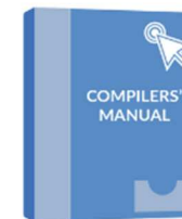
Access to the Compilers' Manual