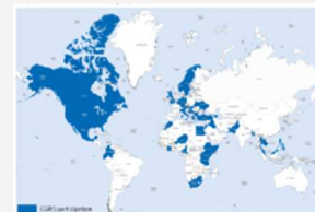
Participation in the work of the EGRIS group