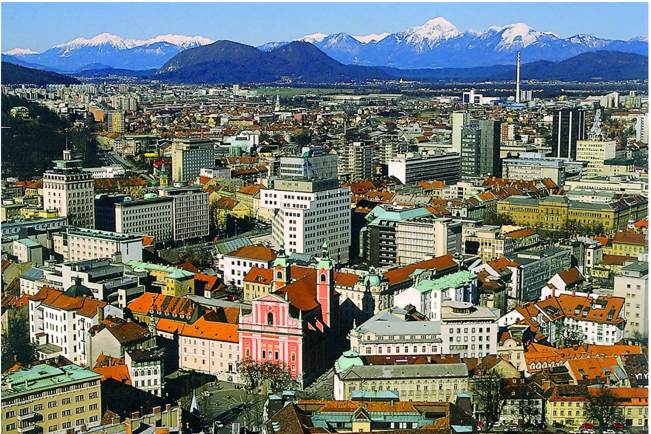
Ljubljana