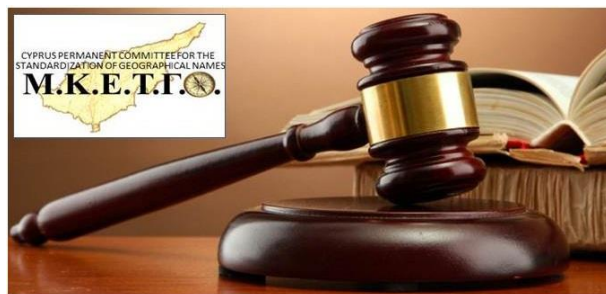
Figure 2: Legislation of CPCSGN

In the exercise of its powers, the Committee selects from the existing types of geographical names, a single type for official and international use, after examining them, based on linguistic, grammatical, aesthetic, social and historical criteria.