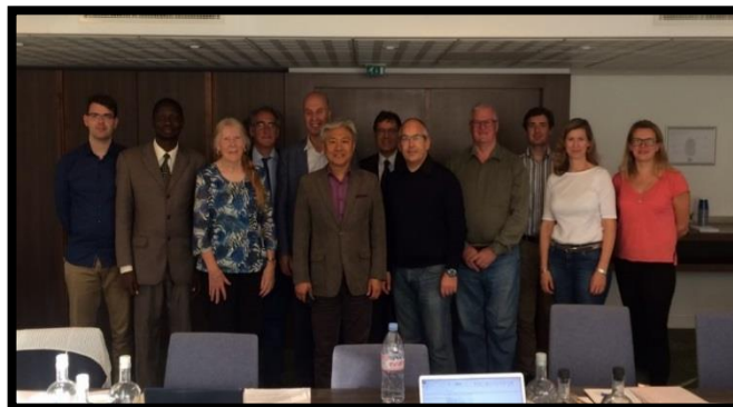
Participants of the Joint Meeting of the Working Group on Evaluation and Implementation and Working Group on Publicity and Funding, Brussels, Belgium, 13 October 2018

The next meeting, also jointly with the Working Group on Publicity and Funding, will take place during the first session of the UNGEGN in New York, April 29 to May 3, 2019.