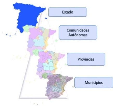
Figure 1: Levels of Territorial division in Spain

Thus, there are three levels of competence corresponding to the State, the Autonomous Communities and the Local Administration (municipalities and others) (fig. 1). Every Administration has the right to create its own competent organizations in geographical names: At a State level we can consider several of them: the Local Entities