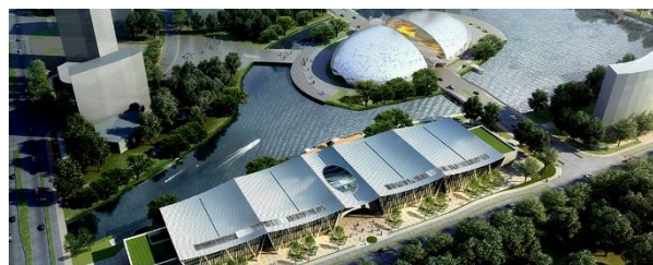
Deqing International Convention Center & Deqing International Exhibition Center

Participants requested a second UNWGIC in four years’ time, to continue to promote dialogue with Governments and between Governments and all stakeholders, including young professionals, and to stimulate progress in global geospatial information management. Participants commended Zhejiang Province’s and Deqing County’s commitment to growing the geospatial information industry, the hospitality and the cordiality of the local community during the week. At the closing ceremony, over 750 local volunteers who exposed the international geospatial community to local culture through their warm and engaging support were recognized through a rousing show of appreciation by participants.