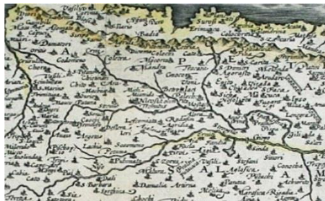
Figure 3: Toponyms of Cyprus – Part of Map of Cyprus (Mercator Hondius), 1633

Cyprus is privileged to have most of its geographical names bequeathed in ancient texts from Homer to Herodotus, the tragic poets and Strabon, up to ancient cartographers, like Claudius Ptolemaeus, and from medieval cartographers, like Abraham Ortelius, up to lord Horatio H. Kitchener, who mapped Cyprus in the 19th Century, at the beginning of the British rule of the island.