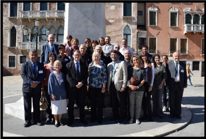
Some of the participants in the symposium “Toponymy and Cartography between History and Geography”, held in Venezia [Venice] Italia, from 26th to 28th September 2018.

The Romano-Hellenic Division (RHD) of the United Nations Group on Geographical Names (UNEGGN) organized its second International Scientific Symposium in Venezia [Venice], Italia [Italy], from 26 th to 28 th September 2018, focused on “Toponymy and Cartography between History and Geography”.