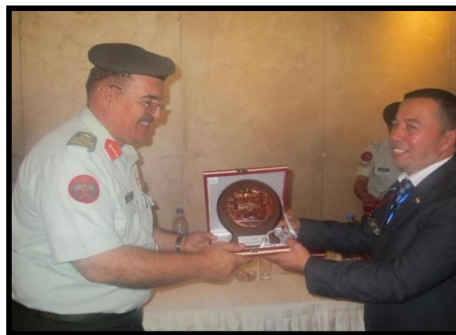
7 th Arab conference on geographical names (ACGN), Amman, Jordan 2014