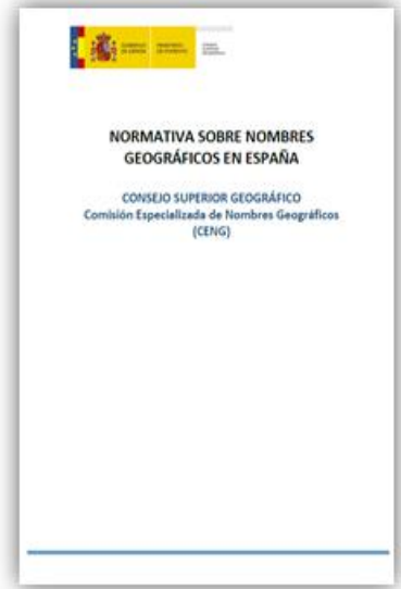
Figure 2: Summary of Spanish legal frame in geographical names

Due to the diversity of Spanish legal frame in geographical names, the Specialized Committee for Geographical Names ( Comisión Especializada de Nombres Geográficos ), a multidisciplinary committee that includes State and regional Administrations, plus other organizations with competence in geographical names, such as Universities and Academies of Language) has published a summary of the Spanish legal frame that can be consulted at FOMENTO website (fig. 2).