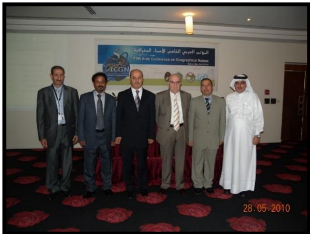
Fifth Arab conference on geographical names Beirut, Lebanon 2010

first in the Arab division of geographical names meeting in Beirut, and since, we met and visited and worked together in many occasions , not only in the geographical names field, but also in many other