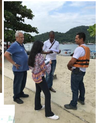
Training Course on the Standardization of Geographical Names – Jun 2018 – Rio de Janeiro, Brazil.