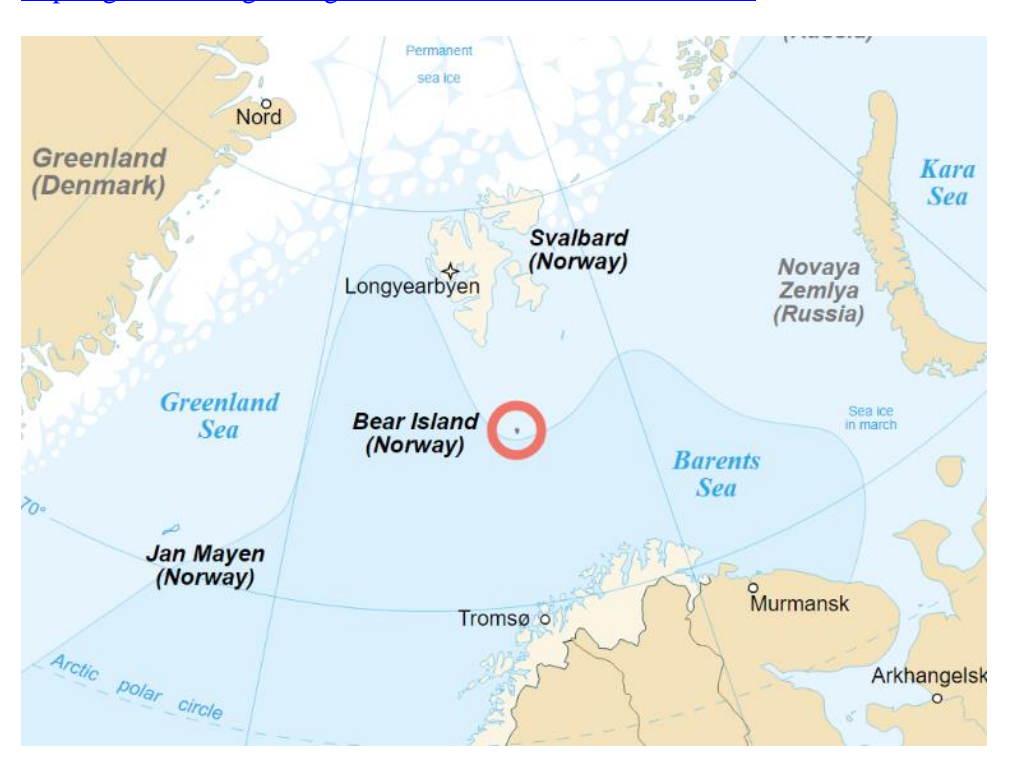
Figure 2. At September's FNC 419, the committee approved the addition of the Conventional name "Bear Island" for the remote island of Bjørnøya, Svalbard. Located between North Cape, Norway and Spitsbergen, Svalbard, the island is home to a nature preserve, meteorological station, and helicopter landing platform.

To begin a feature search in the GNS database, please visit <a href="https://geonames.nga.mil/geonames/GNSHome/welcome.html">https://geonames.nga.mil/geonames/GNSHome/welcome.html</a>.