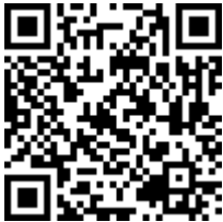
Place type 'Island' represented in the spreadsheet-based feature catalogue: