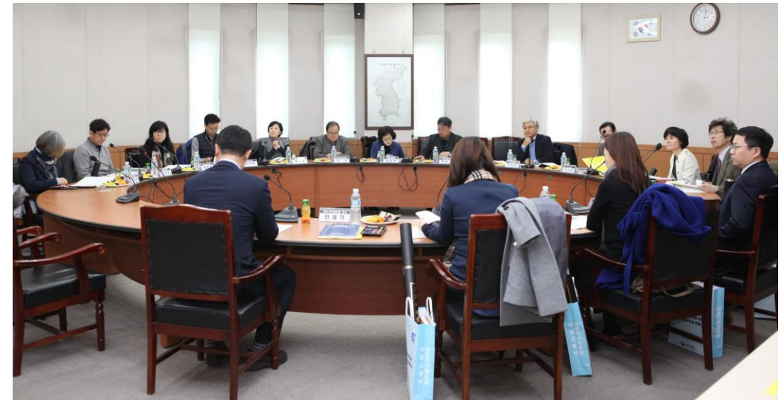
The Korea Committee on Geographical Names (KCGN) https://www.ngii.go.kr/eng/main.do